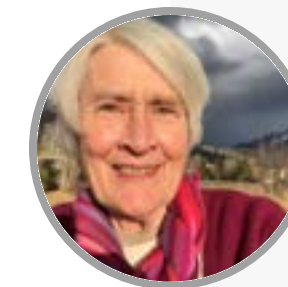
Baji Rankin Excellence and Equity in Early Childhood Education