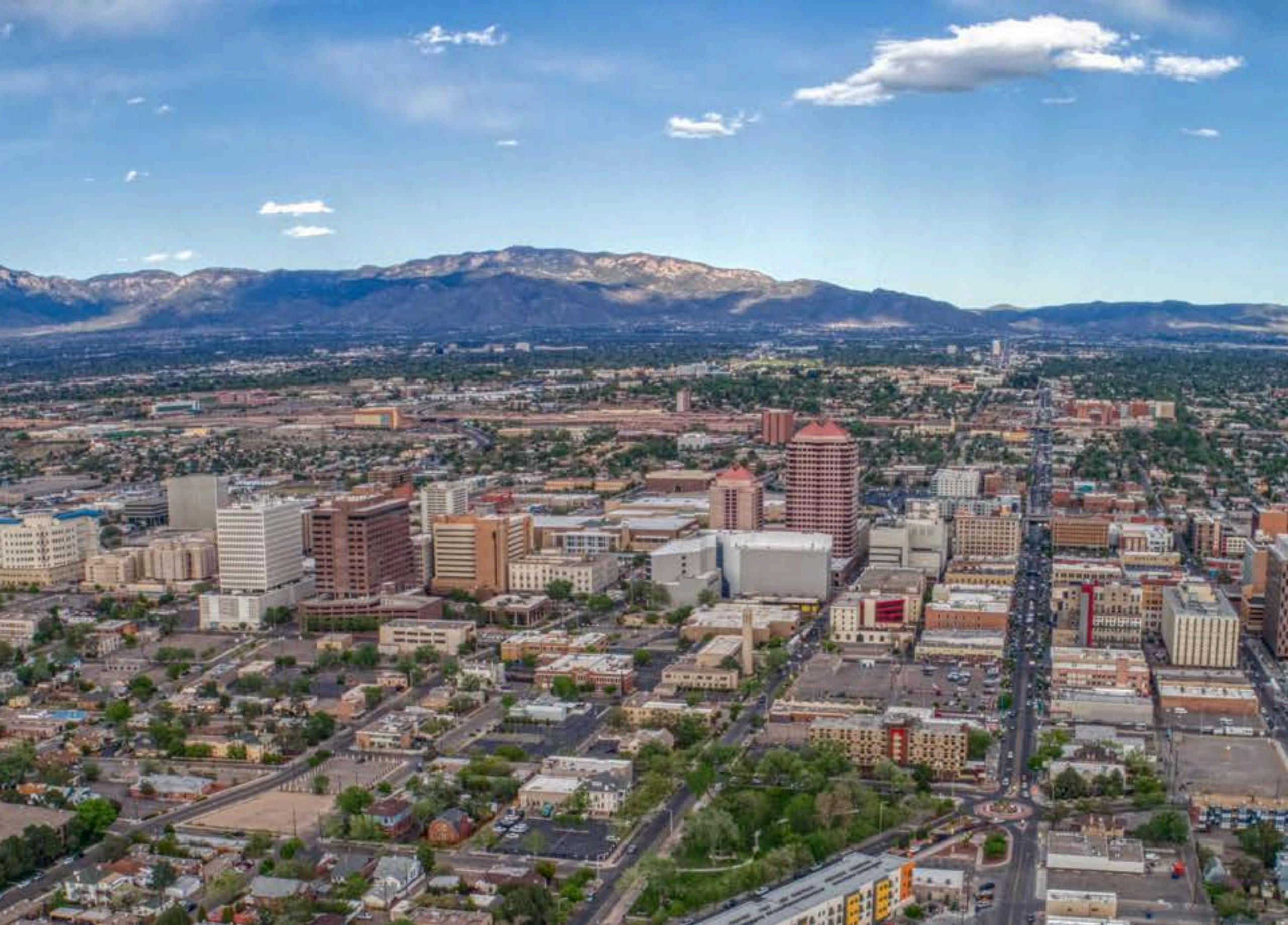
Albuquerque, New Mexico