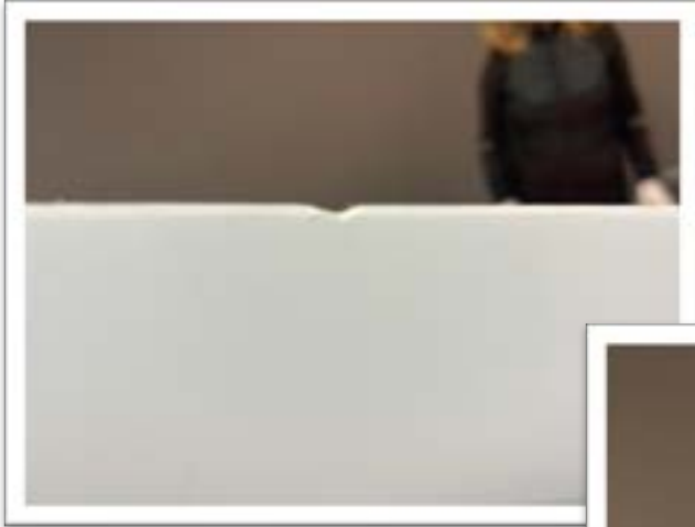
Panel blemish (wear and tear?)