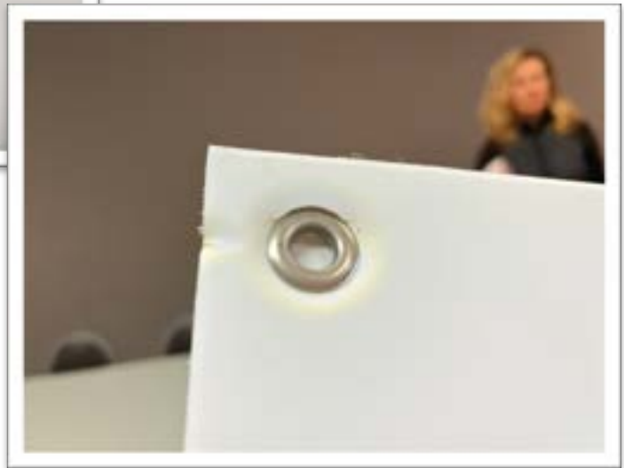
Panel blemish (wear and tear?)

Many of the plastic corner protectors had come loose from the panels. We are not sure if these are to be used for shipping, or to be placed on the panels while on exhibit. Please advise.