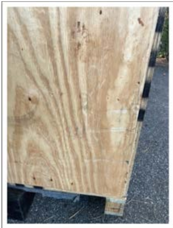
Scuffs on crate.