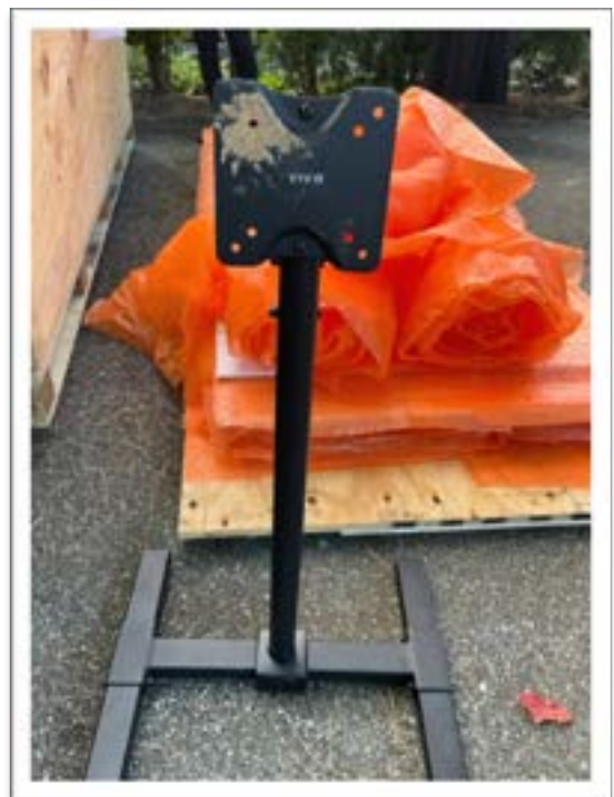
Rust on TV stand.